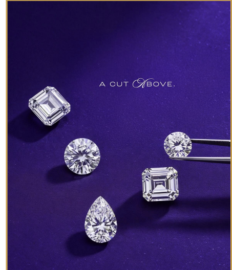
One stone, one decision.

Of every 1000 diamonds, only 4 make our cut.