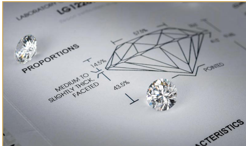
Proportions of a round brilliant. The ratios below live inside these lines.